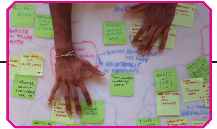
Maximize your innovation potential