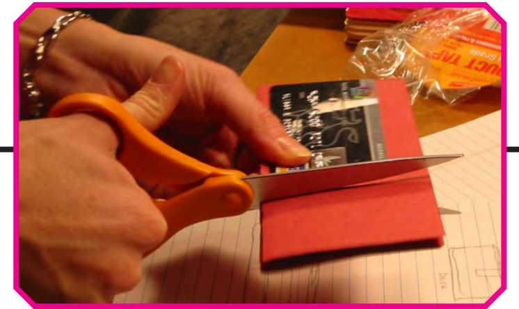
You can learn a lot from a very simple prototype

To manage the solution-building process. Identifying a variable also encourages you to break a large problem down into smaller, testable chunks.