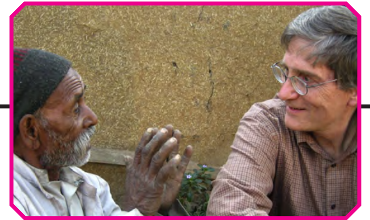
In empathy work, connect with people and seek stories

Engaging with people directly reveals a tremendous amount about the way they think and the values they hold. Sometimes these thoughts and values are not obvious to the people who hold them, and a good conversation can surprise both the designer and the subject by the unanticipated insights that are revealed. The stories that people tell and the things that people say they do—even if they are different from what they actually do—are strong indicators of their deeply held beliefs about the way the world is. Good designs are built on a solid understanding of these beliefs and values.