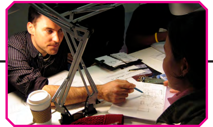
The key to user testing is listening .

To refine your POV. Sometimes testing reveals that not only did you not get the solution right, but also that you failed to frame the problem correctly.